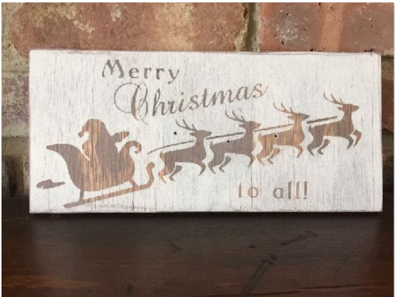
Merry Christmas to All! Wall sign by www.WoodyThings.com

In addition to select items from each artist, we've listed a link to the shop's website, so pay them a visit and check out some of their other amazing products!